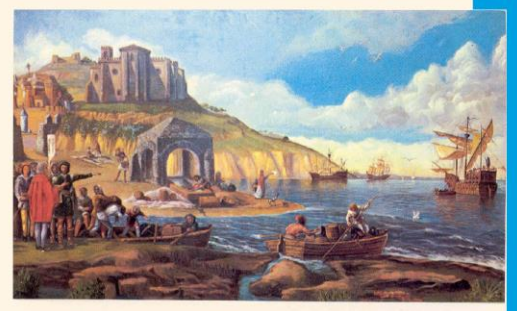
PUERTO de PALOS - AGOSTO 1492