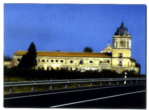
MONASTERIO DE SAN ISIDORO DEL CAMPO, SIGLO XVI (SEVILLA). SÍMBOLO EMBLEMÁTICO DEL PROTESTANTISMO HISTÓRICO ANDALUZ.

INSTITUTO ESPAÑOL DE EVANGELIZACIÓN A FONDO